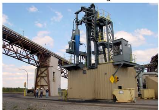
Automated Truck Auger