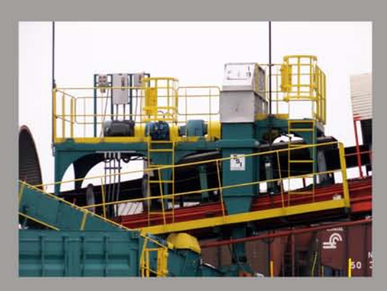
Horizontal Rotary Sweep