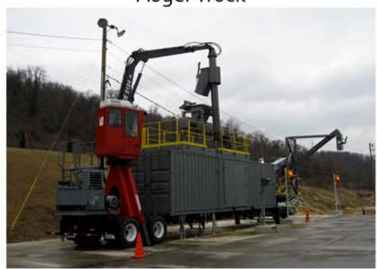
Trailer Mounted Auger