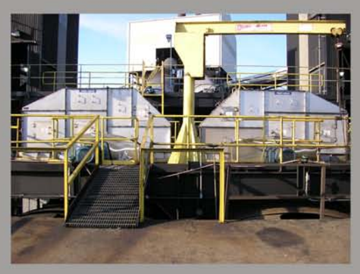
96" Primary Samplers